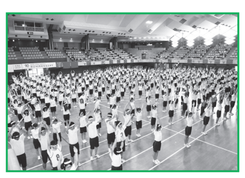
All of the Junior and Senior High students warming up for the event

This year was our first sports festival at the Tokyo Budokan. The junior and senior high school had Sports Day together. I was impressed by how fast the high school students ran. They were great. When I become a high school student, I want