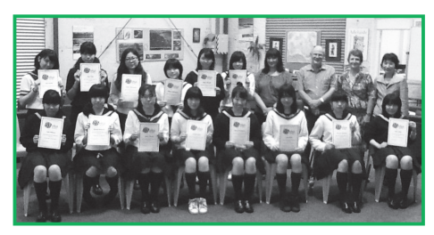
Study trip closing ceremony

My host mother was strict and her cooking was good. She gave me the opportunity to do things