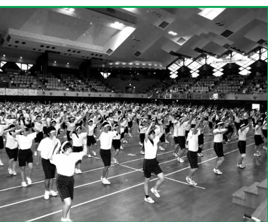
All of the students warming up for the event

day in New Zealand, but that just made it a more exciting and new experience. I partook in the three-legged race and Tamaire, a Japanese game where everyone throws balls into a basket on a tall pole. I was a little scared for the threelegged race because everyone was so fast, but it ended up being really fun. I could see that Mejiro Kenshin students have great teamwork!